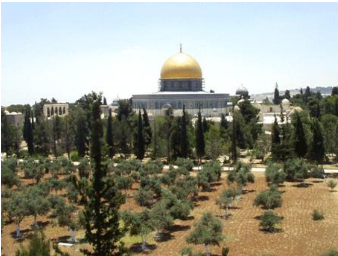
Praetorium...the Fortress of Antonia?