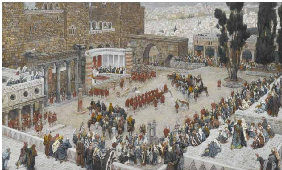
Bird's-Eye View of the Forum: Jesus Hears His Death Sentence By James Tissot (1836-1902) on Display at the Brooklyn Museum No known copyright restrictions